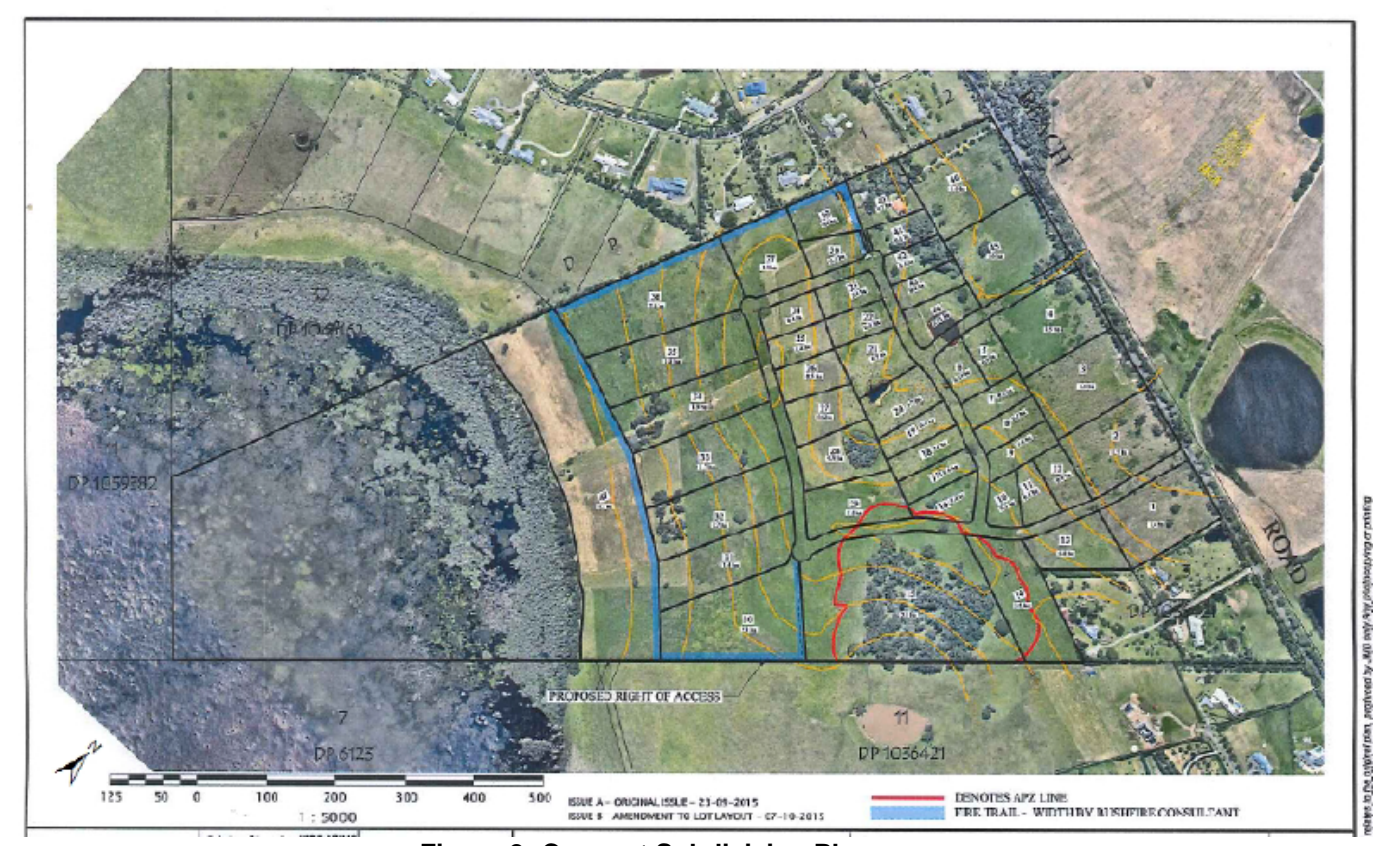
Figure 2: Concept Subdivision Plan

subdivision plan (Figure 2) to show how the land could be developed if rezoned. It is proposed that the part of the land within the Coomonderry Swamp would be dedicated to the State government and incorporated into the Seven Mile Beach National Park as an outcome of the rezoning.